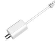
LR1002 ePoE Over Coax Converter